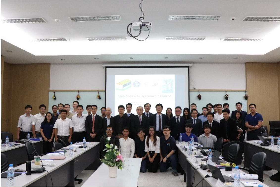
Fig. 1. A group photo of the participants after the symposium

The discussion during the symposium will help improve technique of steel sheet pile and spread the knowledge of press-in technique. The activity of International Press-in Association (IPA) also raises awareness of innovation to improve Engineering society and human life.