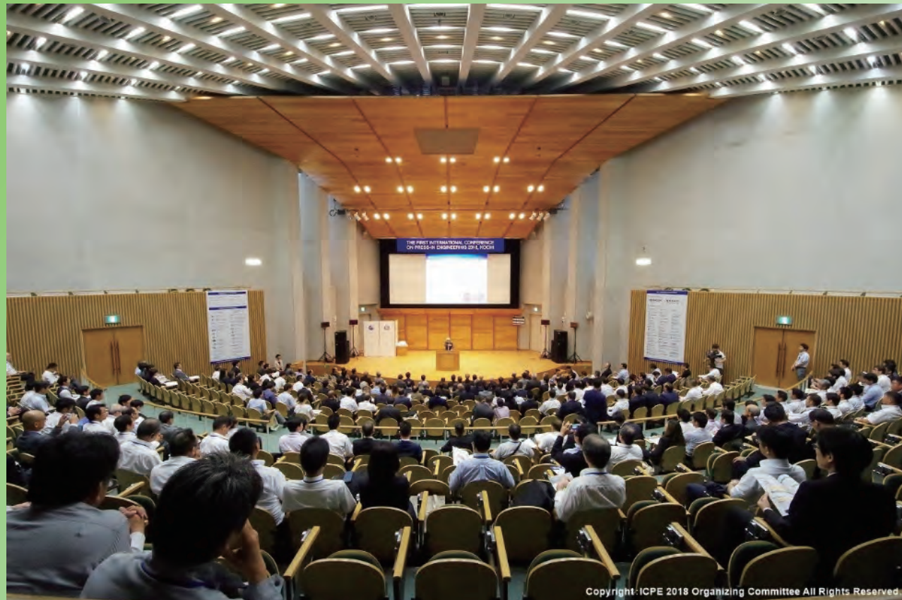
Copyright ICPE 2018 Organizing Committee All Rights Reserved.

Plenary Sessions : 19 June (Sat) and 20 June (Sun) 2021 Technical Tour : 21 June (Mon) 2021 Venue : Kami Campus, Kochi University of Technology etc. ICPE2021 Website : https://icpe-ipa.org/