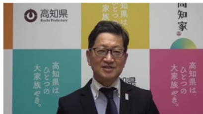
Seiji Hamada Governor of Kochi Prefecture