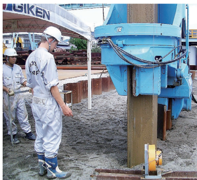
GIKEN • The University of Cambridge Joint Research