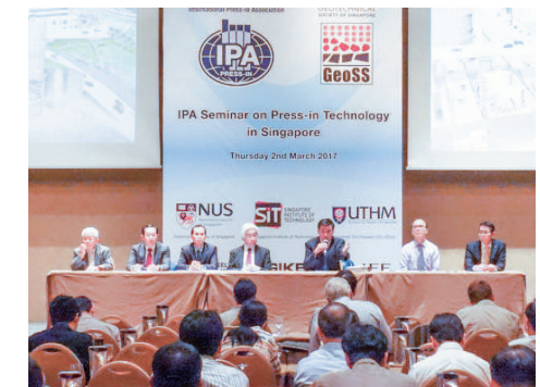
IPA Seminar on Press-in technology