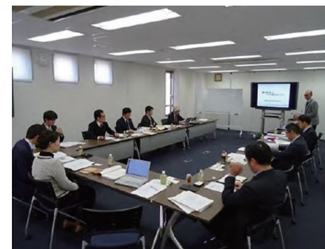
Technical Committee (TC)