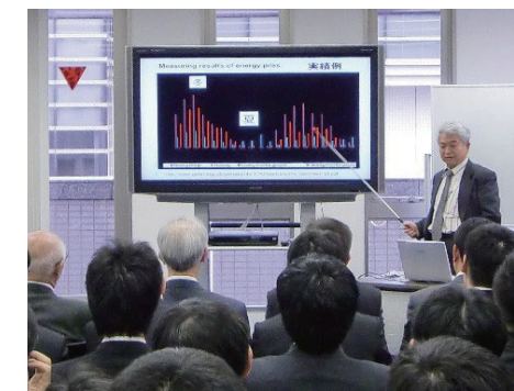
IPA Press-in Engineering Seminar