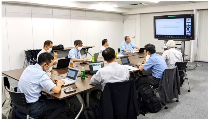
Photo 1. IPA Board meeting in Tokyo