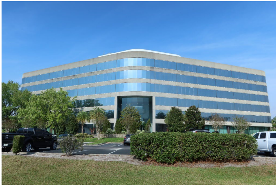
Fig. 1 GAC's Orlando Main Office on 5 th Floor

Since its incorporation in 1999 as a wholly-owned subsidiary of Giken Limited, GAC had been promoting the press-in piling method by directly undertaking press-in piling work; i.e., being a piling subcontractor using Giken press-in piling machines. However, from 2009 to 2010, the corporate policy changed not to be directly involved in construction and rather to focus on promulgation of the press-in piling method with increased sales and rentals of press-in piling machines. In the process of this transition, GAC transferred its construction crew and open subcontracts to one of the current press-in piling machine user companies. Since then, GAC's business focus remains the same to date. Its New York office was opened in 2018. Figure 1 shows the office building where the current Orlando office is situated.